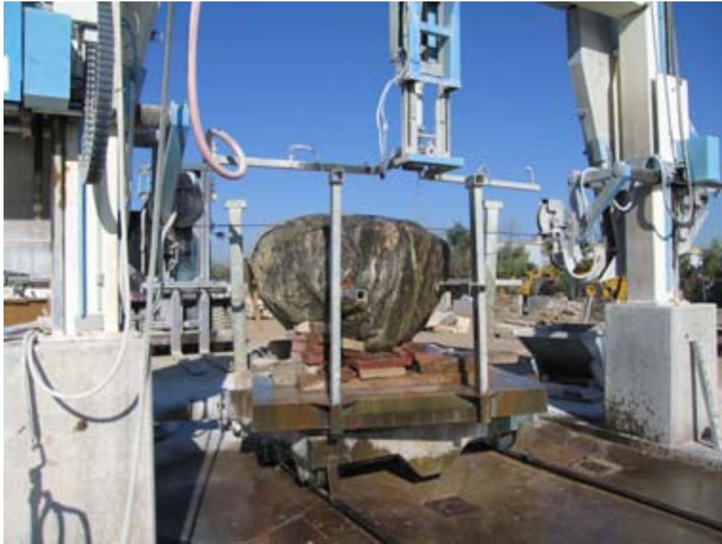
Stone cutting, Spring 2007